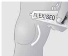
Apply the gel evenly around the joint.